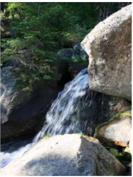
12.Location of alleged sighting of Bigfoot In 1989: Featured on the TV show "Unsolved Mysteries".